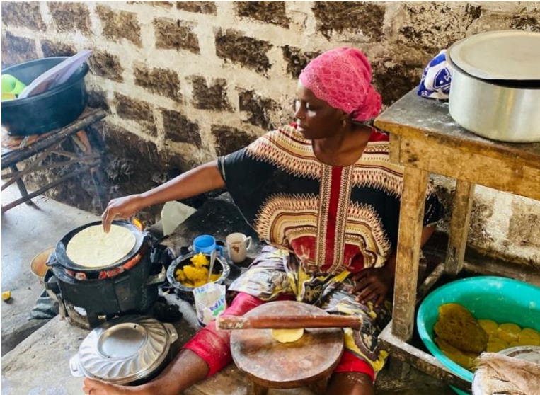
Woman prepares a meal.

The analysis of diets of the children in the sample showed a poor quality diet with low dietary diversity. The low dietary diversity translated to poor nutrient intake of all nutrients analyzed, where no child was able to meet 100% of their daily nutrient requirements for any nutrient in the previous 24 hours. Maize was the primary source for energy and some key nutrients, implying very poor diets for the access of nutrients required for growth and development of the children. It is also clear that fish consumption by the children is very low with most children just being given fish soup without the fish flesh. This provides an opportunity for improving child protein intake amongst other nutrients by encouraging increased consumption of fish. These results show a great need for nutrition education for improved child feeding in these communities.