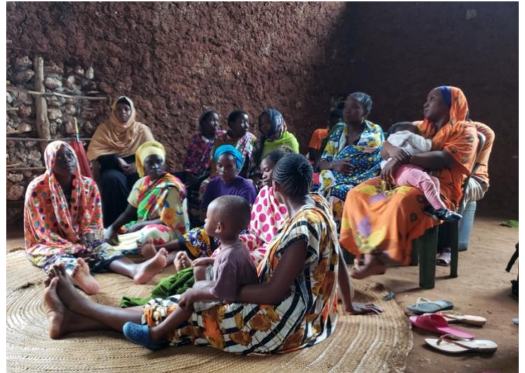
Community meeting discussing nutritional benefits of fish for young children.

In Kenya, 47% of the population live below the poverty line and 26% of children under five years old have stunted growth, an indication of persistent and serious nutrition insecurity. Fisheries are chronically overexploited, and this can be seen in the four-fold decrease in catch for coastal fisheries since the 1980s. Nationally representative data indicate low dietary diversity in vulnerable groups, and only a small fraction of young children (20.9%) reported to have consumed any fish, meat or poultry (Kenya DHS, 2014). Some of the most vulnerable people to malnutrition and nutrient deficiencies are those along Kenyan coastlines and include infants and young children, pregnant and lactating women, and school-aged children living in poor households.